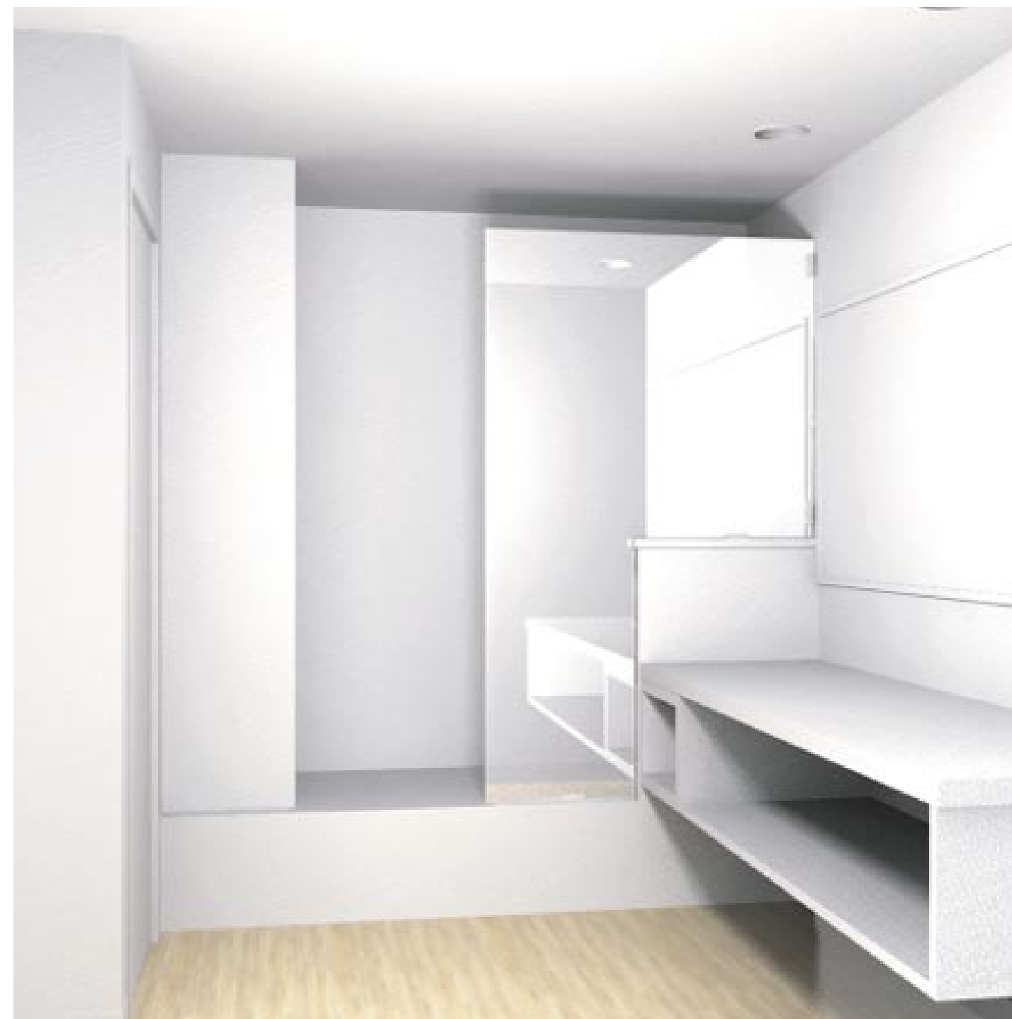
Simple yet Sophisticated

Striking contemporary kitchens present the ideal setting for preparing a quick morning coffee, relaxing Sunday brunch, or sumptuous dinner. Complementing the chic ambiance are durable white microtexture cabinets with aluminum handles and sliding frosted recycled glass doors, stainless GE Profile appliances, dark speckled Corian countertops and Kohler fixtures.