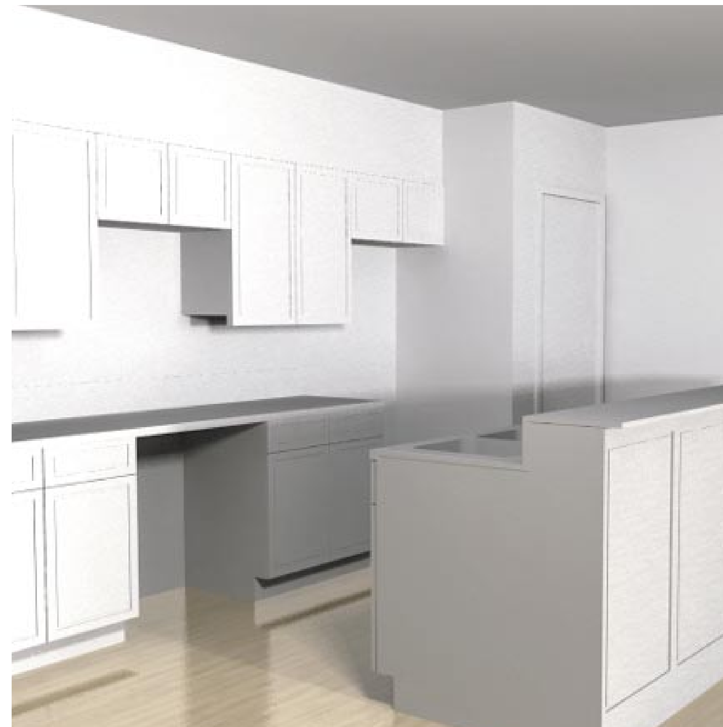
Sleek and Stylish

You know what you want in a home...that special place from which you depart and to where you return each day; a haven for socializing with friends, spending time with family, or enjoying your own solitude. The Ellison affords the unique upscale lifestyle you desire, enhanced by location convenience amid all that Harlem has to offer. Come home to this modern 10-residence gem nestled among a wealth of shops and services, just blocks from transportation, and in the heart of beautiful, historic central Harlem.