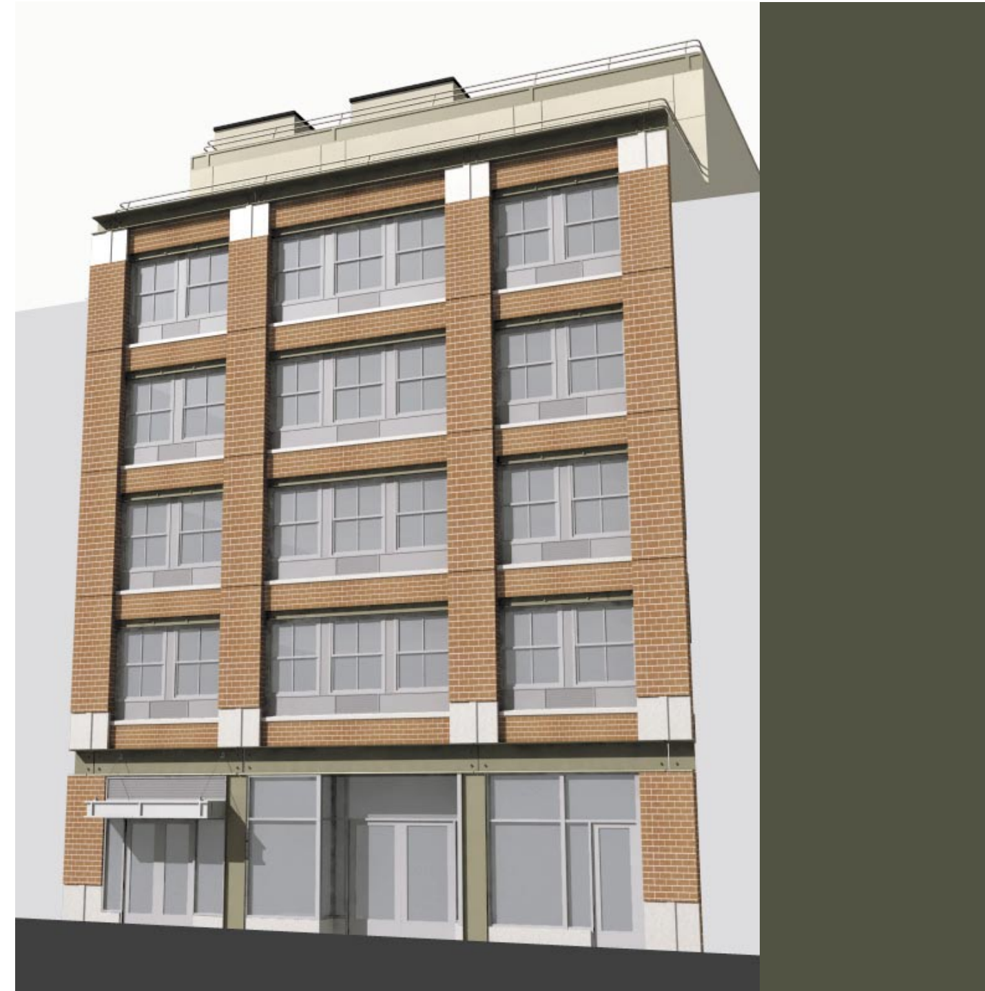
Ellison ... Life Just Got Even Better

You know what you want in a home...that special place from which you depart and to where you return each day; a haven for socializing with friends, spending time with family, or enjoying your own solitude. The Ellison affords the unique upscale lifestyle you desire, enhanced by location convenience amid all that Harlem has to offer. Come home to this modern 10-residence gem nestled among a wealth of shops and services, just blocks from transportation, and in the heart of beautiful, historic central Harlem.